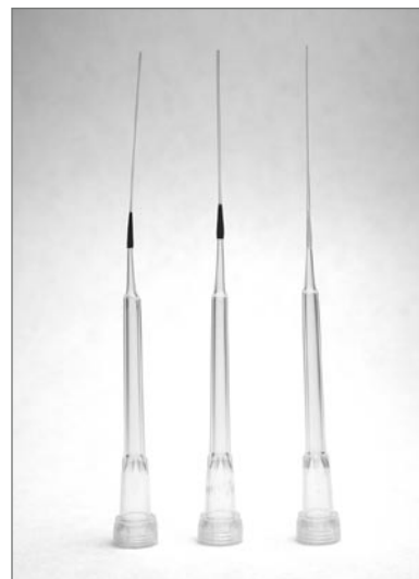
FIGURE 1 Carbon-, TiO 2 -, and ZrO 2 -coated Trap'nTips™

The Trap'nTip is comprised of a standard gel-loader pipette tip containing one of three phosphopeptide-specific sorbents adsorbed to the inner wall. New Objective offers Trap'nTips for phosphopeptide analysis containing titania (TiO 2 ), zirconia (ZrO 2 ), and carbon sorbents.