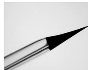
Figure 5 Capillary action draws the sample into the tip-end of the PicoTip emitter