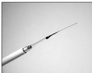
Figure 3 Sample loaded into the Trap'nTip