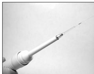
Figure 2 Trap'nTip™ fitted onto 10 µL pipette